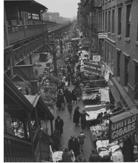
Ninth Ave, 1932