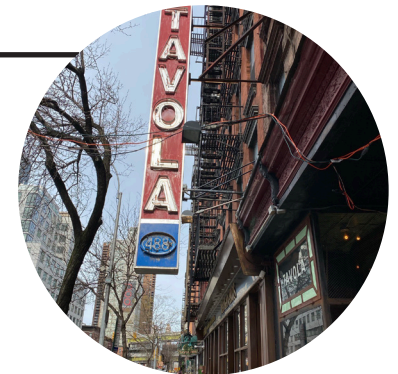
2. Tavola 488 9th Ave, former Manganaro's (est. 1893)