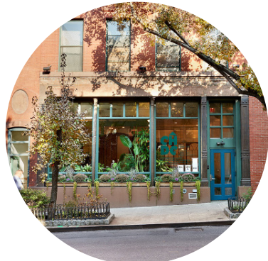
5. CHDC 403 W40th St, built pre-1854, altered 1990s, pre-law tenement