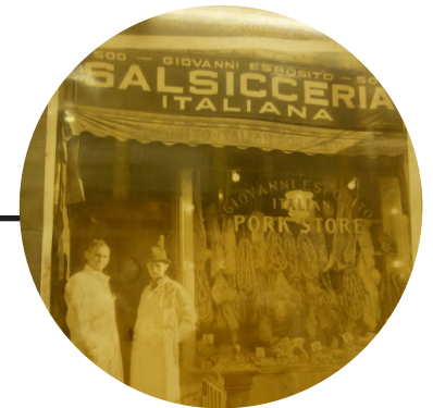
3. Esposito's Meat Market 500 9th Ave, est. 1932