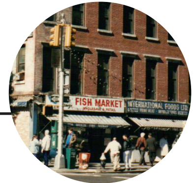
4. International Foods 543 9th Ave (est. 1940s) & Sanitary/Sea Breeze Fish Market 541 9th Ave (est. 1940), photo - 1984