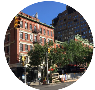
1. 9 Ave between W35 & 36th St mix of old and pre-law tenements