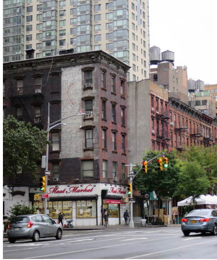
Same block today, 2020 (Higgins Quasebarth).