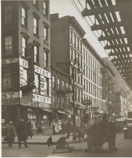
East side of Ninth Ave, between 38th and 37th Streets, 1932.