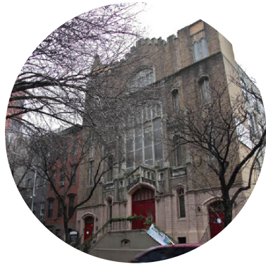
6. Metro Baptist Church 410 W40th St, 1912-14, Gothic Revival style